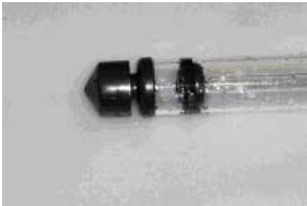
Before removing cap